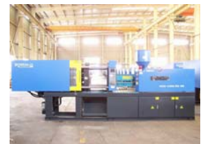
Plastic Injection Moulding Facility